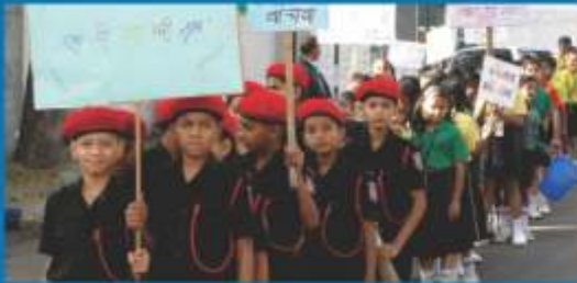
TREE PLANTATION DRIVES

Participation in such initiatives starts from the school students to the post-graduate students.