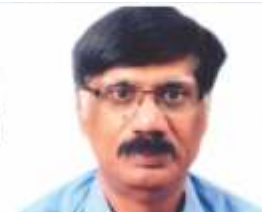
COO at a US Healthcare KPO