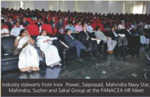
Industry stalwarts from Inox Power, Saiprasad, Mahindra Navy Star, Mahindra, Suzlon and Sakal Group at the PANACEA HR Meet