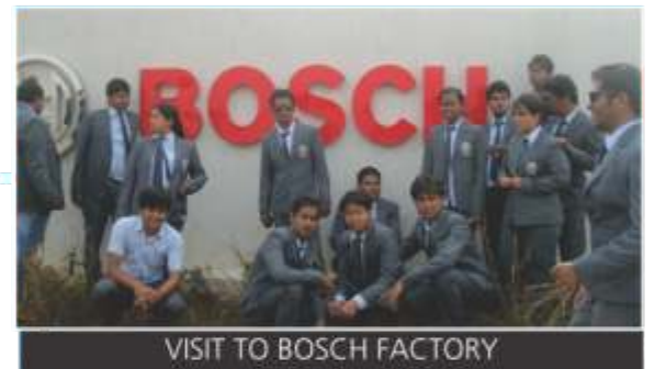
VISIT TO BOSCH FACTORY