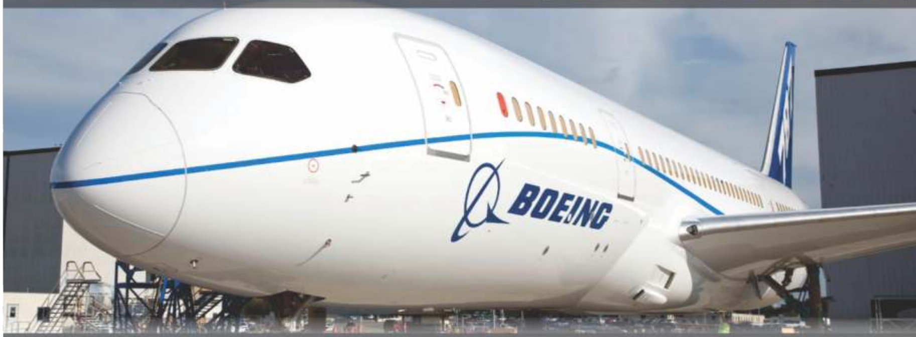
ASM'S IIBR PGDM STUDENTS VISITED THE BOEING'S EVERETT FACTORY IN SEATTLE .

As a part of the curriculum, the students of IIBR participated in a certificate course at the University of San Diego, City University of Seattle in the United States of America, and CETYS University in Mexico. The students of ASM's IIBR got the opportunity to learn from the faculty members of these universities. This was followed by 2 weeks of industrial exposure in the field of their choice.