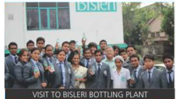
VISIT TO BISLERI BOTTLING PLANT

The students of ASM visited Goa as part of a 3-night-4-day study tour. The students visited the Bisleri bottling plant and Bosch. The students learnt about the processing and bottling of water. Bosch provided details of the customized machinery provided to its customers for packaging of products like Kurkure, Tang, Sun feast, Gemini Oil etc. Apart from the industrial visits, the students participated in various team building activities and sight-seeing.