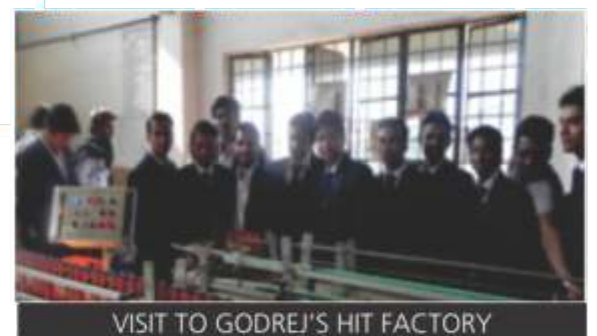
VISIT TO GODREJ'S HIT FACTORY